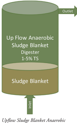
Digester (figure developed by Lucas Loetscher, Colorado State University)

Upflow sludge blanket reactors are similar in design to a complete mix reactor, except that there is no integrated mechanism for homogenizing the waste. Instead, settling of solids is encouraged so that a sludge blanket is formed, maintaining biomass within the system, thus reducing the required holding time. These reactors are highly efficient and have been successfully up-scaled