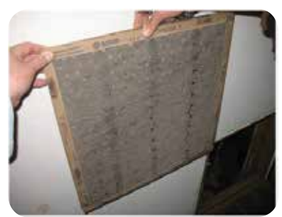
Replacing a dirty furnace filter

Most of the problems with furnaces need to be addressed by trained technicians. There are, however, a number of things that the homeowner can do to improve the performance of their home. First, check to see that all