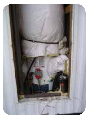
Air sealing and tank insulation

Open combustion hot water heaters use outside air to burn the gas and have draft hoods. In certain situations, such as when the dryer is running, these heaters can back draft which pulls carbon monoxide into the room. They must have a dedicated outside air duct for combustion air supply. Sometimes the inlet duct is through the floor, other times the exterior door has grills. The former approach is preferred so that the door can be insulated.