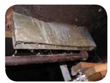
Combustion air inlet