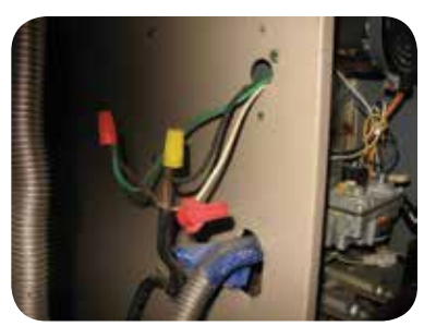
Improper gas & electric connections

the living areas. That cabinet should also be wrapped and taped with sheetrock to provide a fire barrier, although this is usually very difficult to do because of the tight spaces. Often the floor of the compartment has collapsed from water