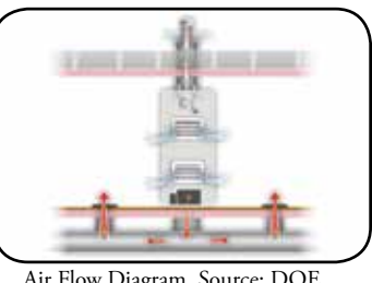
Air Flow Diagram

If there are multiple registers in each room, and there is a large, screened hole in the floor adjacent to the furnace, then you may have a ducted return air system. In this type of ductwork, the cooler returning air typically