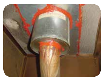
Sealing a flue with metal flashing and high temp caulk

floor registers are open and that they aren't covered by rugs or furniture. If they are, you won't be getting sufficient heat into the areas that need heat and the building and heating system will be unbalanced. We recommend that the dampers in the registers be removed with pliers so that air will flow into the room as intended and the furnace will work efficiently.