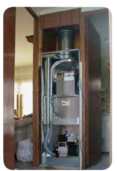
New Sealed Combustion Furnace