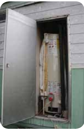
Water Heater Cabinet